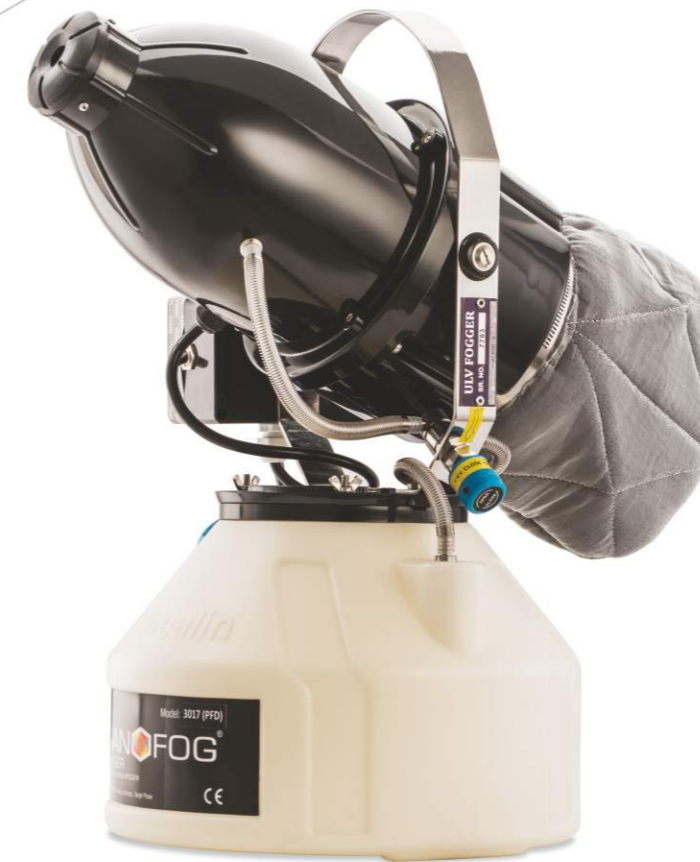
3017 PFD / 3019 PD