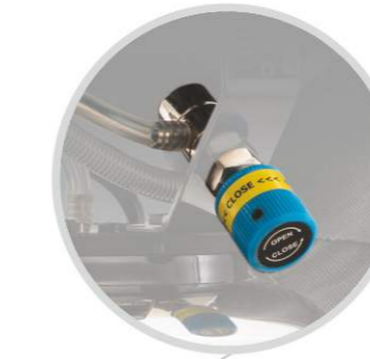
SS316 Grade Flow Control Mechanism