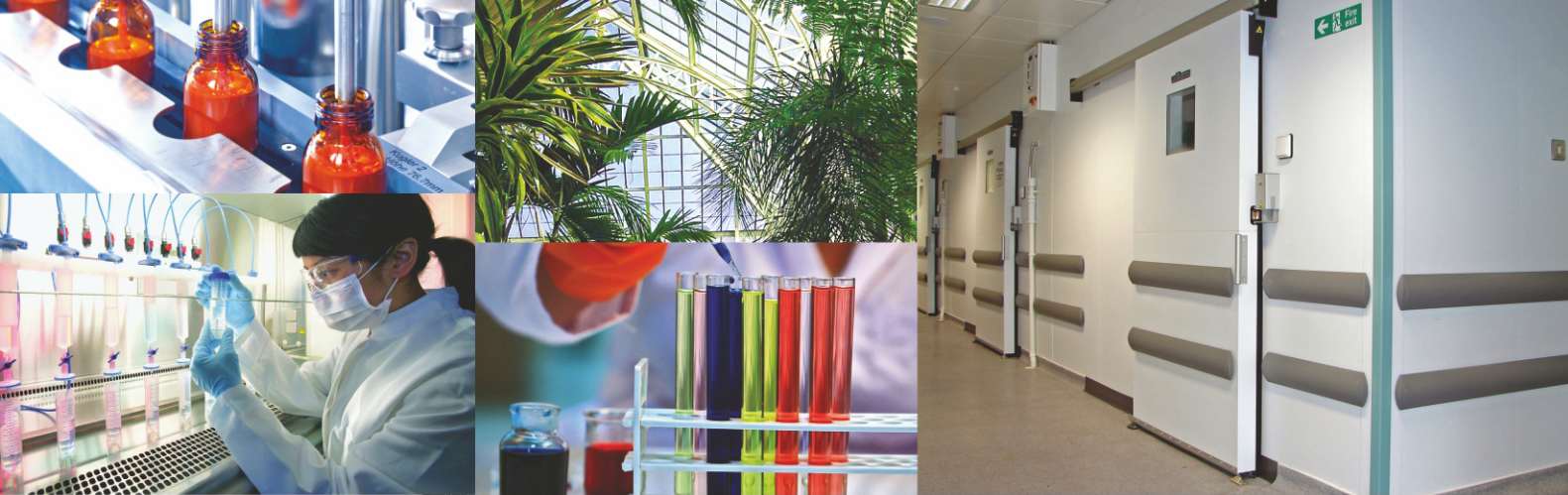
Q.C. Laboratories | Research Chambers | Cold Rooms | Food/Medical Packaging | Curing | Horticulture | Etc.