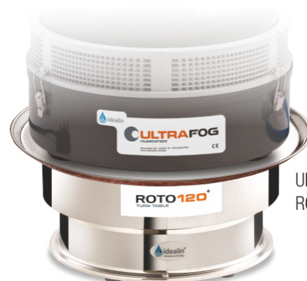
Ultrafog placed on ROTO-120